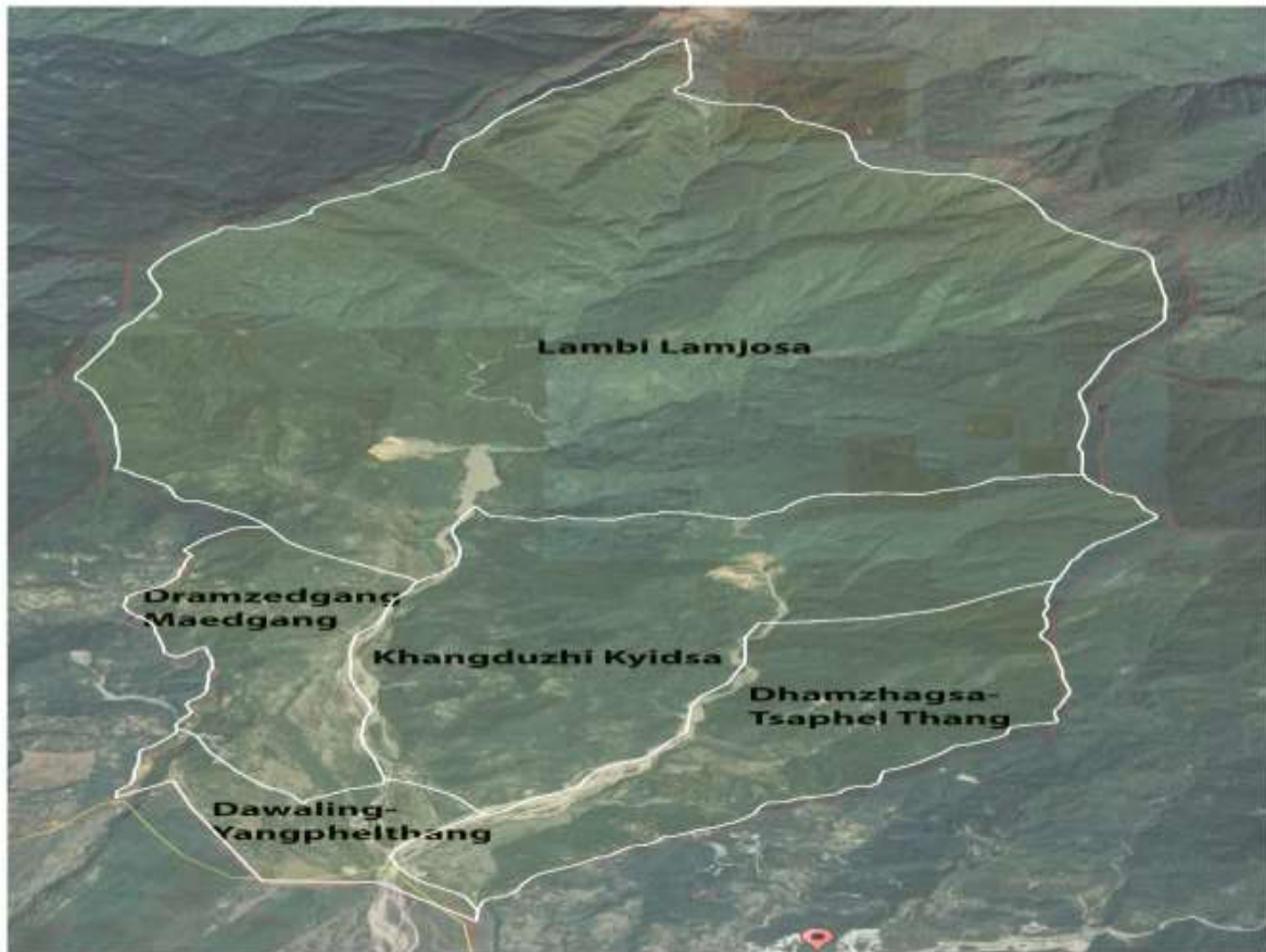
Figure 3 NORBUGANG GEWOG