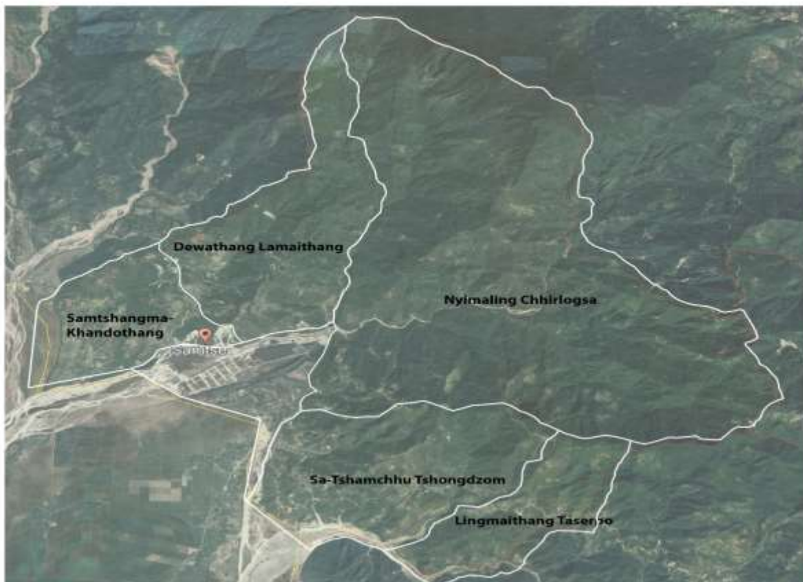
Figure 2 SAMTSE GEWOG